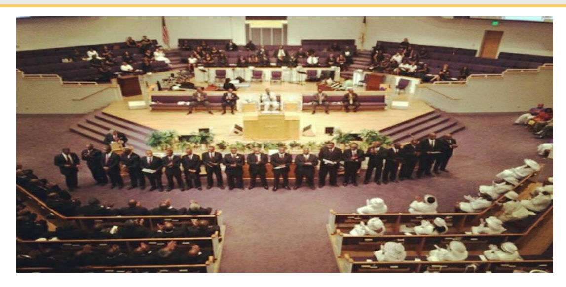
Deacons Ordination Services - July 27, 2014